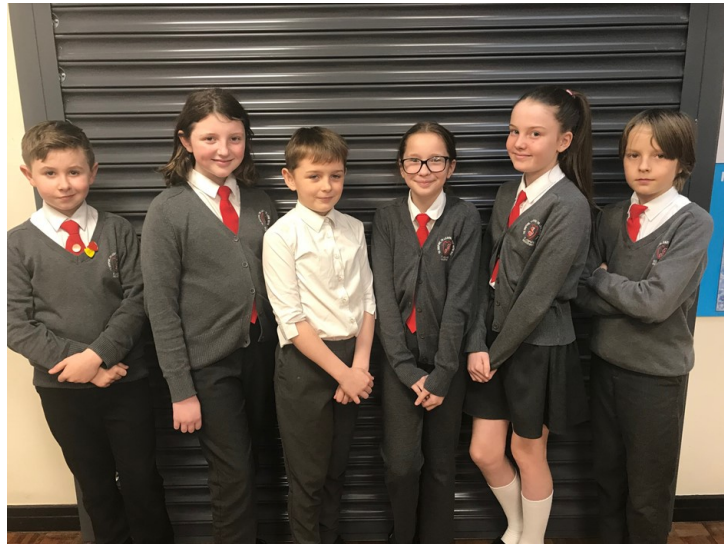
The Editorial Team

We hope that you enjoy this edition of the pupil post- don't forget to tell us if you want us to write about anything in particular- drop a note into Year 6 and we may include it in the next newsletter