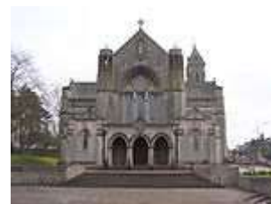
Table Top Sale - Sunday 17 th March

The Children's Liturgy during the 9.15am Sunday Mass at Our Lady of Lourdes is a fantastic and fun opportunity for children to hear the Sunday Gospel message at their level and respond to it using artwork. This takes place on the first Sunday of each month during the 9:15am Mass and also whenever there is a school Mass.